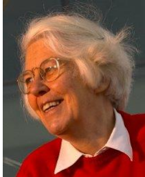
Karen Spärck Jones