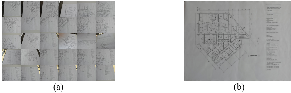
Figure 2. Sample reconstructed full drawing image: (a) partial drawing images and (b) full drawing image automatically output from the method.