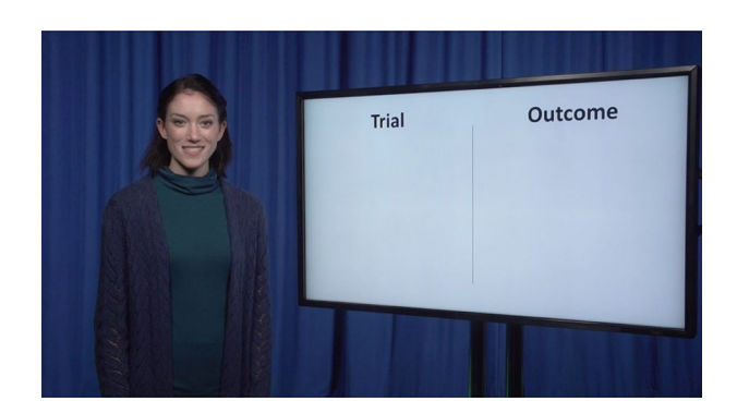
Fig. 1 Still image from instructional video

The role of emotion in academic learning is well-founded in the literature, which indicates that emotions are an important element to consider in teaching and learning (e.g., Becker et al., 2014; Brünken et al., 2010; Christianson, 1992; Knörzer et al., 2016; Pekrun, 2011, 2017; Pekrun et al., 2011; Plass & Kalyuga, 2019; Tyng et al., 2017). It is important to distinguish between the learner's felt emotion during learning and the instructor's