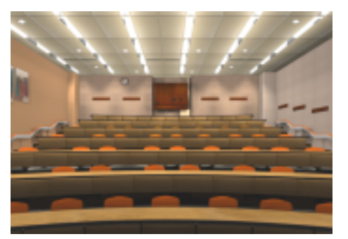
Figure 2 Maximal configuration of virtual extension.

Feedback from educational science was used in the design process of each of these components.