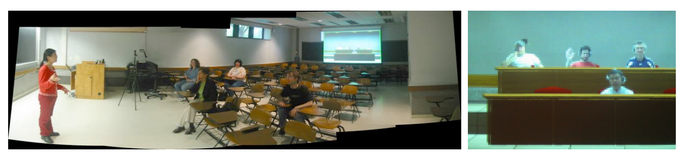
Figure 1 Distance learning system developed by the class. The remote students are integrated into a virtual extension of the classroom, projected onto the back wall ( left —panoramic image, and right —magnified fragment of back wall