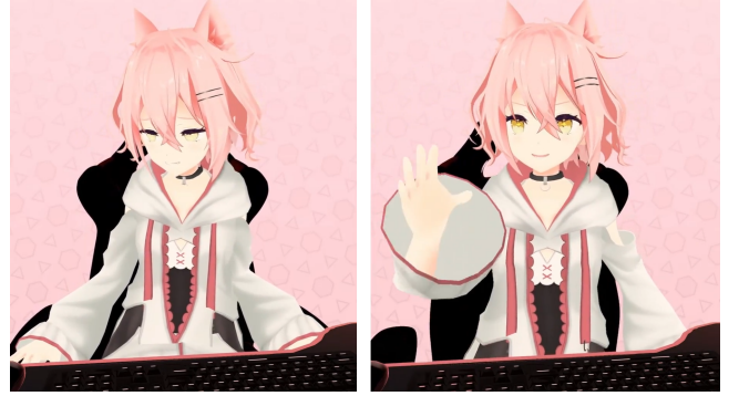
Figure 3: Same frame for different persona parameter values: shy/introverted (left), confident/extroverted (right).

Persona parameters. Finally, AlterEcho allows the streamer to tune the avatar persona along two dimensions: energy level and degree of extroversion. These high-level controls can produce the typical “extroverted and energetic” and “introverted and reserved” avatars, while also allowing for a shy but energetic avatar who avoids eye contact while making numerous nervous gestures, or an