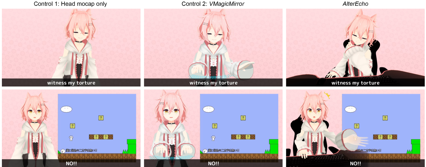
Figure 4: Frames from the three-way comparison from our user study.