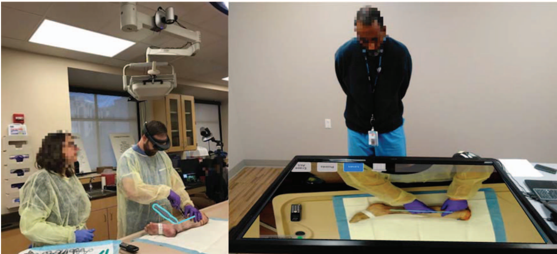
FIGURE 2. Example Use of the STAR ARHMD Platform. A remotely located mentor can use the platform to transmit surgical guidance to a local mentee. This guidance will be visualized in 3D by the mentee wearing the ARHMD. A nurse assistant, member of the research team, stood by the mentees during our clinical validation to assist the mentees in aspects such as cleaning fluids.

to see the effect of the telementoring experience in a leg fasciotomy with respect to the participants' level of expertise.