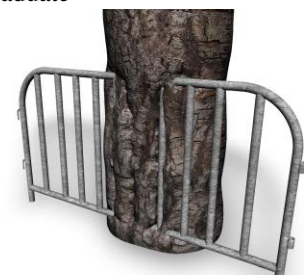
Environmentally sensitive procedural growth of wood.

Levels: Graduate, Professional, Undergraduate Schedule Types: Lecture Offered By: College of Science Department: Computer Science Course Attributes: Upper Division May be offered at any of the following campuses: West Lafayette Restrictions: None Prerequisites: CS 58000 (or equivalent)