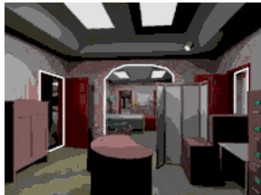
Figure 2: Portal Textures. The portals have been replaced with textures.